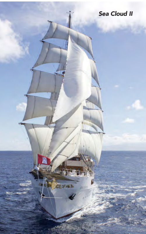
Sea Cloud II