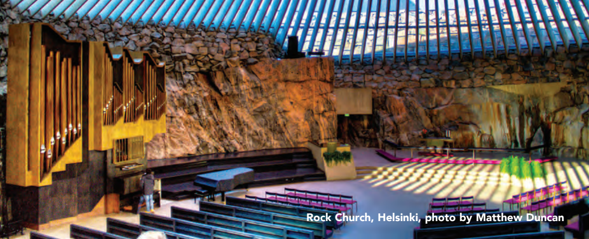
Rock Church, Helsinki